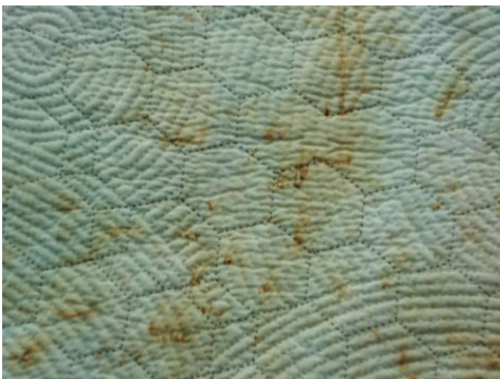
Detail image of artwork

The hand stitched swirls give the piece visual and physical texture. They could be caused by springs, bugs, or eddies beneath the surface of the water. A chain link fence motif is hand stitched over top of the swirls as an added visual. This artwork is designed to be displayed in any orientation.