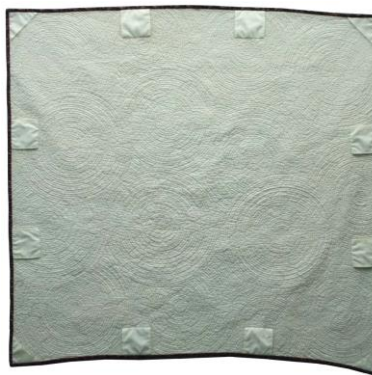
View of back of artwork